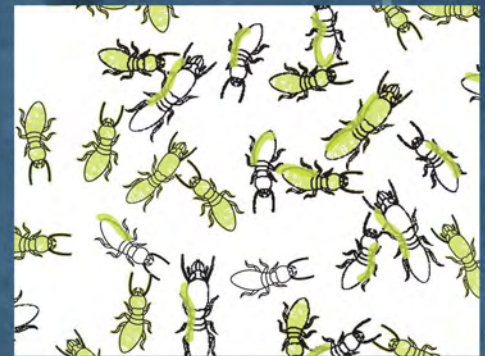
The Prothor Effect. Termites passing the effect of Prothor to each other.